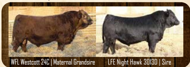
WFL Westcott 24C | Maternal Grand sire

Whether for the show ring or the breeding pen, this is a real favourite here! Her Westcott dam was sourced from the great folks at Mar-Mac last fall and wow has she ever impressed. She calved herself, is great maternally, rebred right away, kept good condition, and weaned off a real impressive heifer. Kasey looks poised to follow in the footsteps of her mother, but with a touch more style to her. This is a real balanced heifer - Kasey has tremendous volume in her centre third and great width of base, yet is clean in her lines, moves freely, and has loads of femininity though her front end. To top it off, she's quiet, kid show broke, and should be a lot of fun next year!