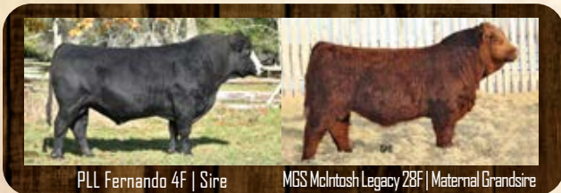
PLL Fernando 4F | Sire