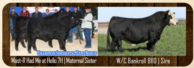
Mast-R Had Me at Hello 7H | Maternal Sister