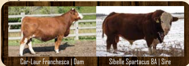
Car-Laur Francesca | Dam

Stylish, well marked, and dark red, PLL King is an attractive, eye catching Full Fleckvieh bull. The power of Spartacus crossed with the maternal greatness of the famed Barbarella cow family offers a unique and interesting breeding piece. PLL 2Ks dam was sourced as a high seller from the Autumn Classic sale, where the Barbarella 845Y daughters have consistently topped the sale ring to great acclaim. She has great spring of rib, udder quality, freedom of movement, and excellent profile traits which should be passed on through her son. This is a unique combination of pedigree and phenotype, take note!