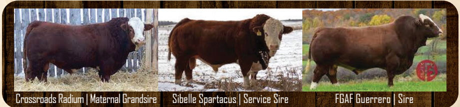
Crossroads Radium | Maternal Grandsire Sibelle Spartacus | Service Sire FGAF Guerrero | Sire

It gives us pleasure to offer this unique bred female as the lead off lot in this sale. Heidi brings a deep cherry red colour pattern covering ample muscle on a moderate frame. She strides easily on sound feet and has a smooth maternal front end. Her maternal grandam, Nossaterra Pol Honeymoon has been the foundation of our polled Flechvieh program. Heidi can be the same for her new owner. Her extra age and moderate condition will help her ease into productivity. We should keep her, but have a Spartacus 8A sister coming on. Bred to Sibelle Spartacus 8A on April 17, 2022. Preg checked favourable to that date.