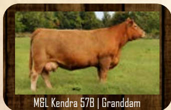
MGL Kendra 57B | Granddam

Thick, stylish and a good mover best describe this early April sweetie! Her sire Honour IH has been siring the right kind of naturally thick, balanced calves that are born easily. Her dam is a productive young female bred the same way for next year. Visitors pick Katrina out quickly. She will make an ideal junior yearling for Junior Simmental and 4-H members' projects.