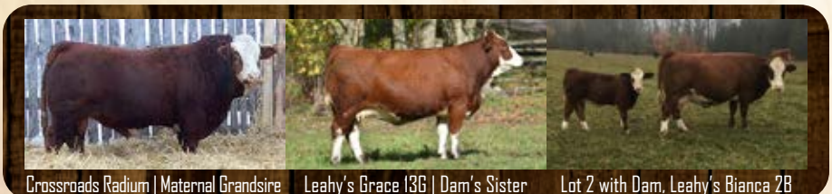
Crossroads Radium | Maternal Grandsire Leahy's Grace 13G | Dam's Sister Lot 2 with Dam, Leahy's Bianca 2B

Here is the ideal calving ease option in a smooth polled, Flechvieh mode!! Although amply muscled, this Guerrero son is smooth from nose to tailhead. He is moderately framed with lots of style and moves like a cat. Jackson is well pigmented and comes from one of our most productive females, Bianca 2B, a maternal sister to last year's high seller. We confidently used him on select heifers with calving ease in mind.