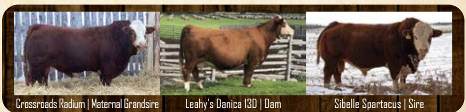
Crossroads Radium | Maternal Grandsire Leahy's Danica 13D | Dam Sibelle Spartacus | Sire

Soggy, easy tempered with lots of testicle. Sounds like a young Flechvieh bull well on his way! This fella has just kept progressing from day 1. A deep body with a well sprung rib cage contributes to his overall mass. Kaiser's maternal grand dam is the same Honeymoon that anchors our polled Fullblood group. This Spartacus 8A son has maternal strength coming from both sides of his pedigree.