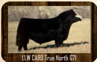
LLW CARD True North G71

Having sampled True North last year and then when he was Champion Simmental at Agribition and a Top Ten Finalist in the CN Supreme, January couldn't come soon enough. This calf well represents his influence. This year 75% of our herd is bred to True North. Kiwi's Dam was Reserve Senior Heifer Calf Champion at the Toronto Royal.