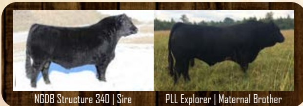
NGDB Structure 340 | Sire

Power bull here! Out of the popular NGDB Structure bull whose sons topped sales across Western Canada this spring, this guy should really be sticking around to breed in our herd. His Red Label dam has truly been a cornerstone of our purebred program and has raised bulls working for breeders from Manitoba to New Brunswick. At 11 years old she shows no sign of slowing down, the kind of profitable longevity we all can use. This bull is powerfully made, good footed, with skull and shoulder structure suited to calving. A true mix of time tested and popular genetics, he should sire powerful, growthy calves, with great maternal ability locked in for his daughters.