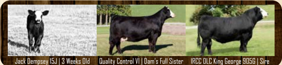
Jack Dempsey 15J | 3 Weeks Old

100K DNA tested Homo Polled, Homo Black and Non Red Charlie. Vet inspected and semen tested at 14 months with 42 cm testicles.